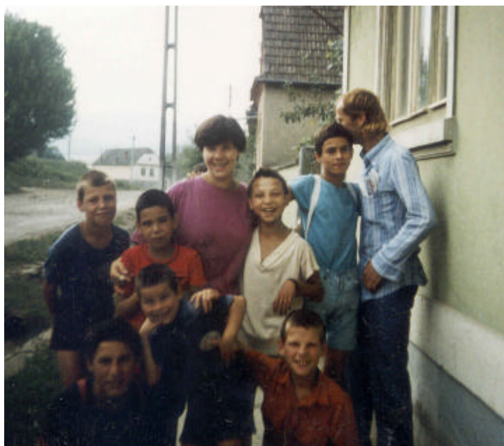
SCI Workcamp in Bazna July 1991